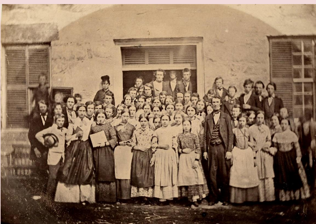
Figure 1 Class of 1852