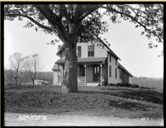
Tucker Homestead Sawyers Mills, Boylston, Massachusetts