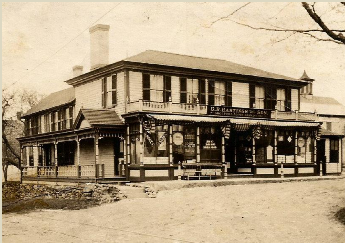
G.R. Hastings & Son Store Groceries & Grain Boylston Center